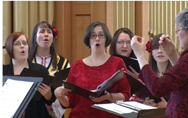
Illuminare and Slaveya Women's Ensemble, 2012

For this remarkable Lenten program, we will be joined by Ensemble Gaudior’s consort of viols as we explore the glorious music of the English Renaissance. Hear the stunning Lamentations of Robert White and William Byrd’s lovely verse anthem Christ Rising , along with works by Dowland, Sheppard, Tomkins, and Weelkes.